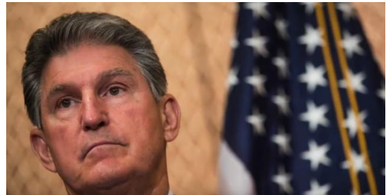
Screengrab from Americans for Limited Government’s ad “No Time for Silence” (0:38)