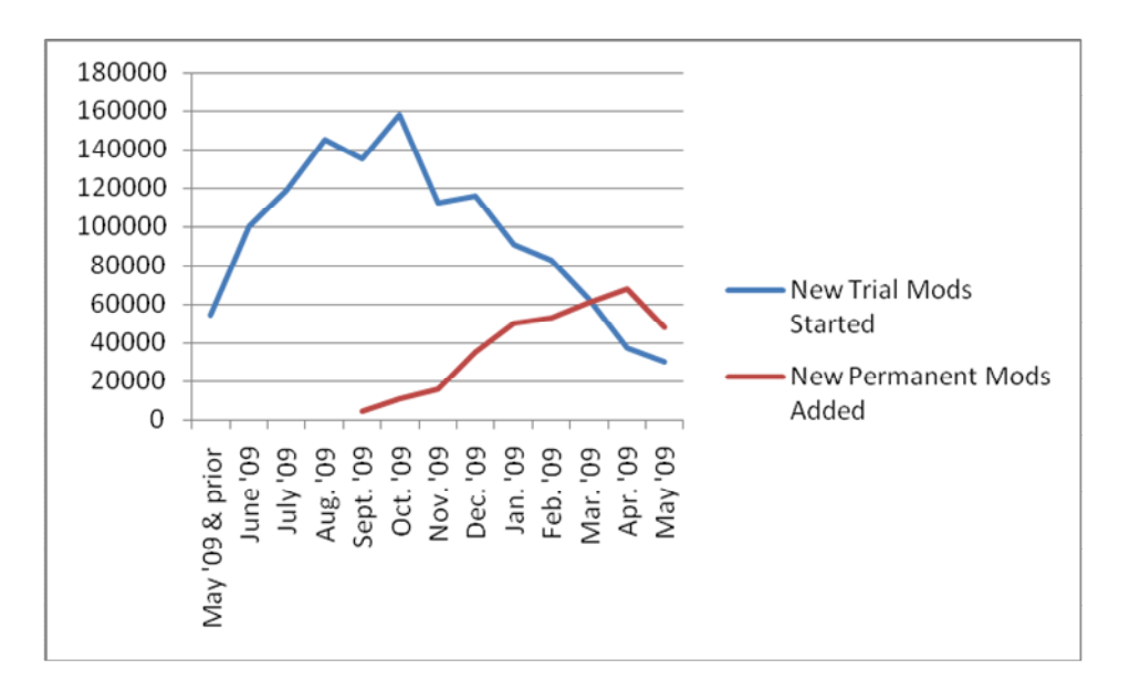
Chart 3 – New Trial and Permanent Modifications Started Under HAMP